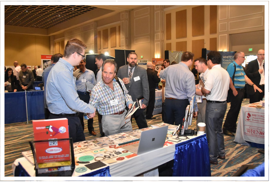
EXHIBIT AT THE G/C EXPO 2022